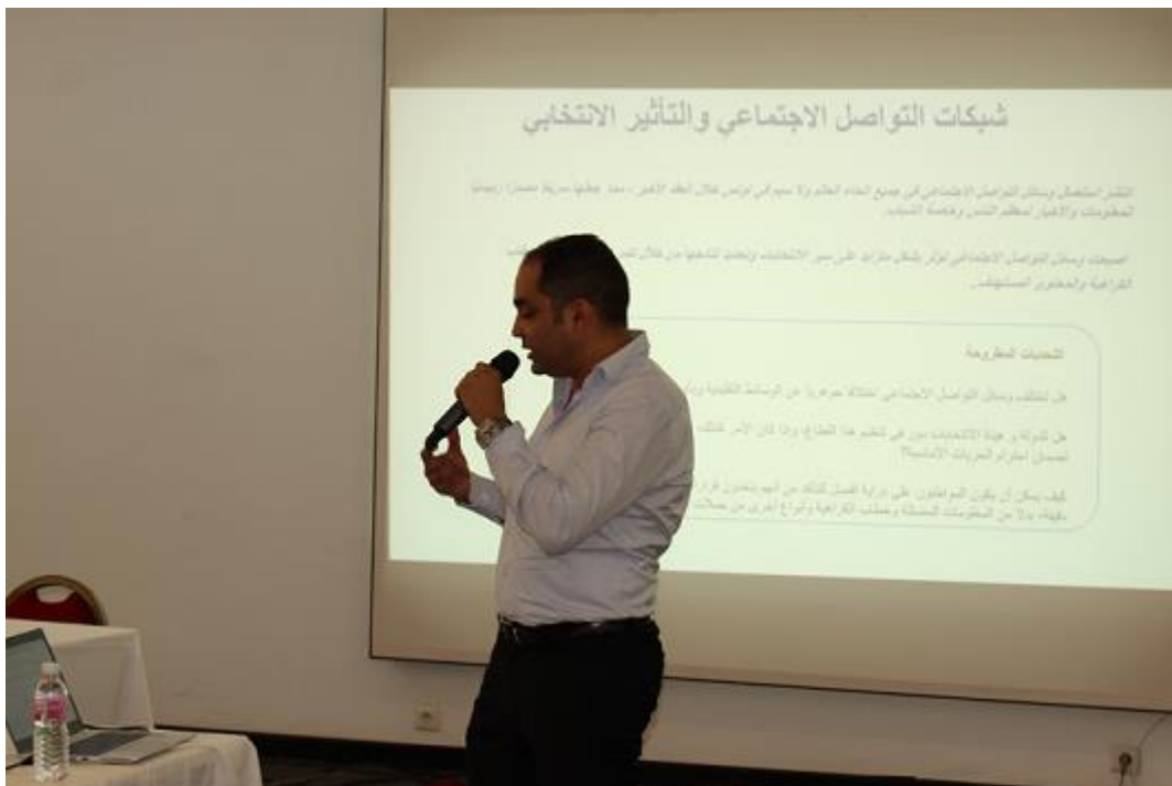
Hammamet, 25 September: TEAP ICT Specialist Discussing Monitoring of Electoral Campaign on Social Networks during TEAP's workshop of experts addressing possible reforms for the framework of electoral campaign

This project is co-funded by the European Union, Italy and Switzerland